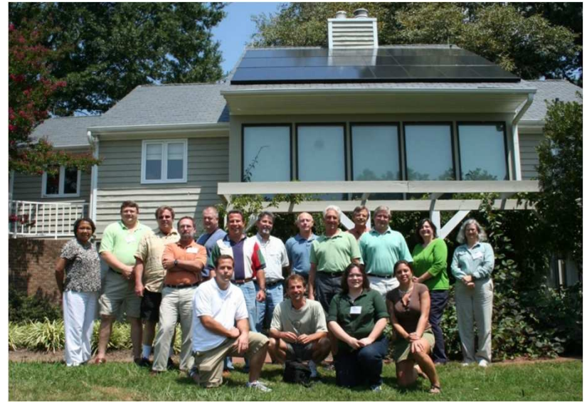
GB-II: Green Building Diploma Series Graduation Day Raleigh, NC July 2008

Note: C=Commercial buildings, R=Residential buildings