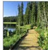
Public Land Agencies